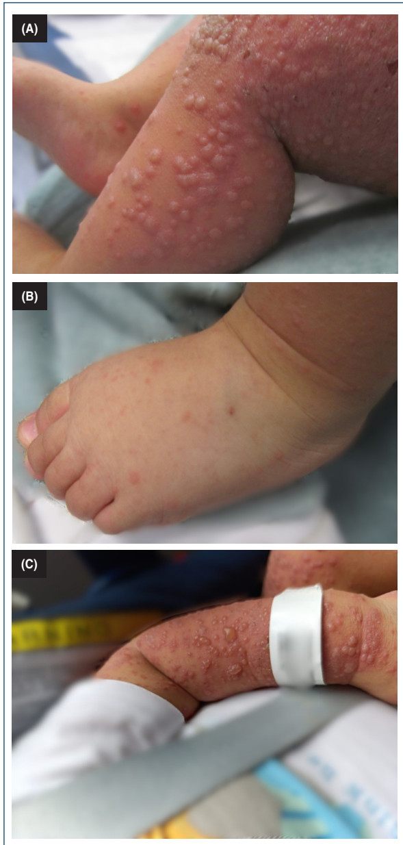
Figure 1. A: papulovesicular rash. B: hands and feet rash, involving the dorsum of feet and fingers. C: tense bubble in the extensor surface of the left arm.