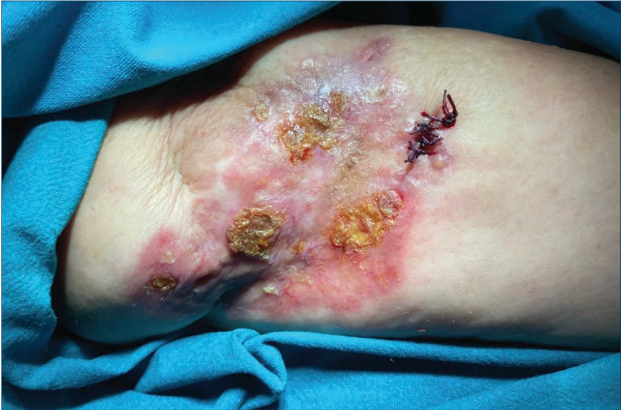
Figure 2. Multiple 2-5 mm hyperkeratotic plugs over the erythematous and infiltrated plaque.