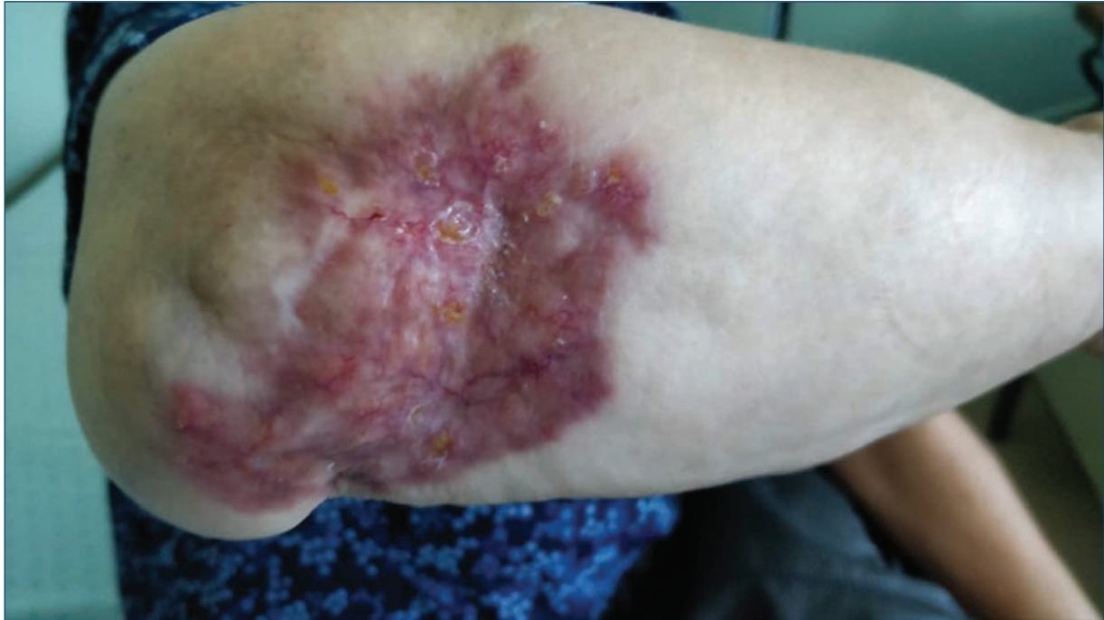
Figure 1. An erythematous, infiltrated plaque measuring 10x8 cm, with an atrophic yellowish, telangiectatic center at the location of a previous surgical scar on the right elbow.