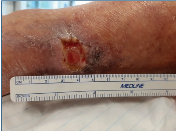
Figure 1. Chronic non-healing skin ulcer located on the right leg, measuring 2 × 1.5 cm.