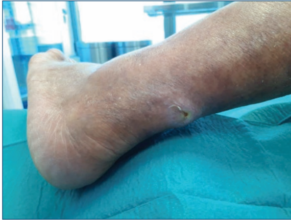
Figure 5. Two months after the procedure the wound bed was almost fully healed.

the skin. The scalp constitutes an anatomical area suitable for harvesting skin grafts, given its accessibility, low risk of infection, fast healing, negligible cicatricial remnants, and stem cells availability 7 . Besides, when comparing donor areas of the scalp and abdominal skin, the former has demonstrated a faster and higher regenerative potential 4 . This is due to the higher number of hair follicles, most in anagen phase, providing elements for a faster growth rate 2 . The growth rate of hair follicles in the wound bed seems to be different when compared with follicles implanted into the scalp for hair transplantation 8 . It is not known why this happens, but it has been suggested that this may reflect the microenvironment of the injured wound bed, that prioritizes the regeneration of the wound healing instead of hair growth 9 . We report this case to support scalp punch grafting as a therapeutic option for chronic skin ulcers. This is a simple procedure that does not require expensive equipment or general anesthesia and can be performed in a small surgery room by a dermatologist.