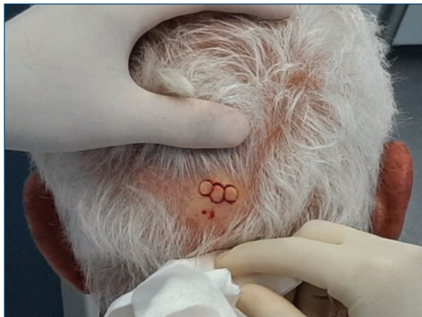
Figure 2. Collection of three 6 mm scalp punch biopsies.