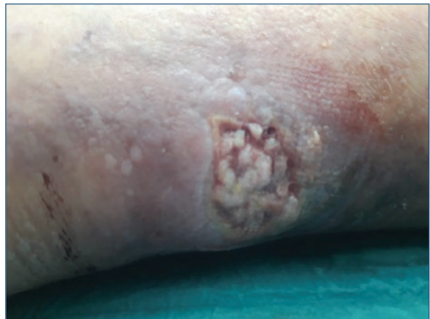
Figure 4. One week after the procedure, 50% of wound was covered by the grafts.