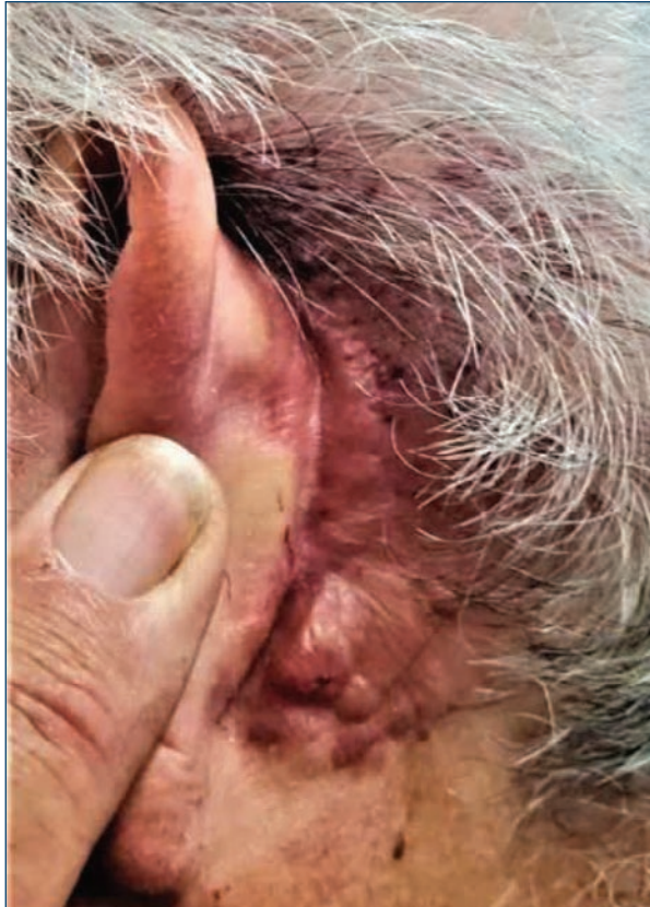
Figure 1. An erythematous-violaceous infiltrated, poorly delimited lobulated plaque, with cystic reas and erosions on the left retro-auricular region, extending to the occipital area.