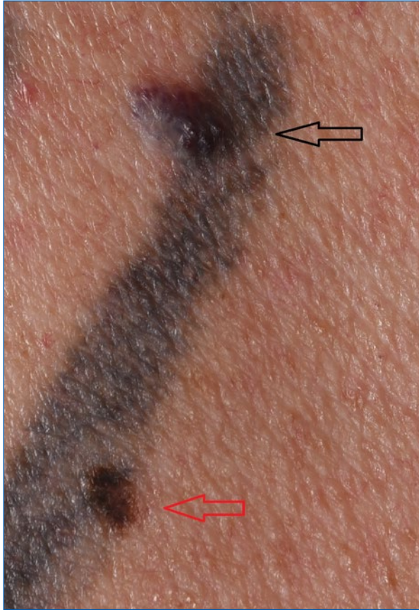
Figure 1. Two pigmented lesions over a black tattoo whose histopathology revealed an hemangioma (black arrow) and a melanoma explanation only in text (not beneath photo).

The patient's past medical history included diabetes mellitus, arterial hypertension, attention deficit hyperactivity disorder, benign prostatic hyperplasia, and fibromyalgia. He also reported a history of melanoma that had been excised from the back about 30 years earlier. The tumor data could no longer be obtained. Furthermore, a superficial spreading melanoma on the right thigh (tumor thickness 0.5 mm, Clark level II, < 1 mitosis/ mm 2 , no nevus association) had been excised in our clinic 2 years prior. Both melanomas had occurred in non-tattooed skin. Follow-ups with a dermatologist had always been unremarkable. As a child, the patient suffered several sunburns.