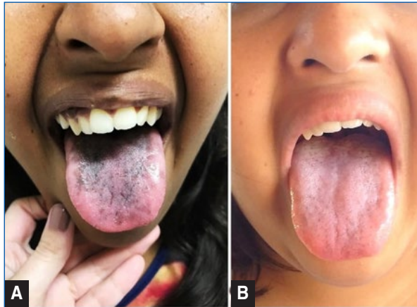
Figure 1. A: grayish brown hyperpigmentation of the tongue at first consultation. B: after treatment with oral glucocorticoids, both skin and mucosa returned to their original aspects.