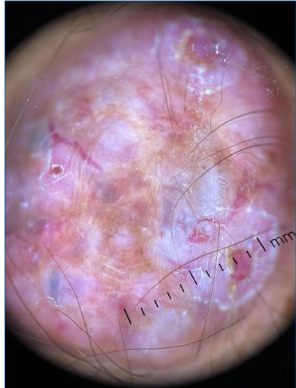
Figure 2. Lesion dermoscopy.

A 40-year-old female patient, phototype III, complained of a “lump” in her right forearm for a year and a half. Dermatological examination revealed a hyperchromic, erythematous, and sessile nodule (2.5 × 2 cm) of firm consistency and with points of ulceration (Figure 1). History of initial growth and subsequent stabilization, mild pain on manipulation. The diagnostic hypotheses of nodular BCC, dermatofibrosarcoma protuberans, amelanotic melanoma, Merkel cell carcinoma, and adnexal tumors were considered. On dermoscopy, the presence of structures similar to blue-gray globules, arboriform telangiectasias with some thickened vessels, bright white spots, and points of microulceration (Figure 2). An excisional biopsy was performed and the material was sent for