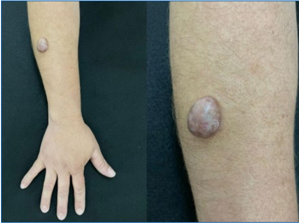
Figure 1. Hyperchromic, erythematous, sessile nodule of firm consistency, and with points of ulceration.