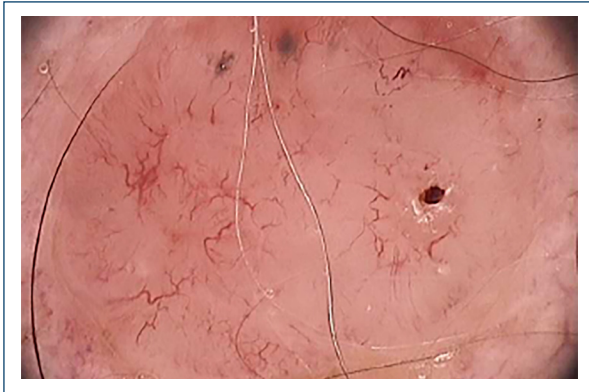
Figure 2. Digital dermoscopy image.