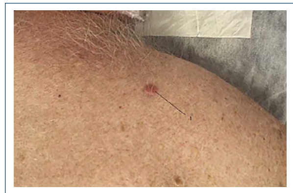
Figure 1. Nodular lesion on the back.

A GE ultrasound machine with a high-frequency probe (20 Hz) with color Doppler revealed thickening at the level of the dermis and a color Doppler pattern showing increased vascularization with blood flow around the lesion (Fig. 3).