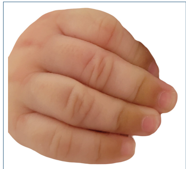
Figura 1. Brownish-orange, well-defined macules on the dorsal surface of the distal phalanges.

Transient hyperpigmentation of the distal phalanges is a benign cutaneous condition, described mainly in newborns with darker phototypes and uncommon in children with lighter phototypes 1-4 . These pigmentary changes represent a physiological variant whose etiology remains incompletely understood and may be related to transient hormonal changes during the neonatal period 1-3 . The differential diagnosis includes potentially serious conditions, such as congenital adrenal hyperplasia and