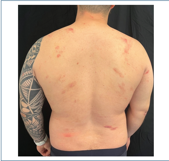
Figure 3. Dermatitis on the posterior trunk characterized by erythematous papules and plaques with a slightly scaly surface and erythematous-brownish nodular areas.