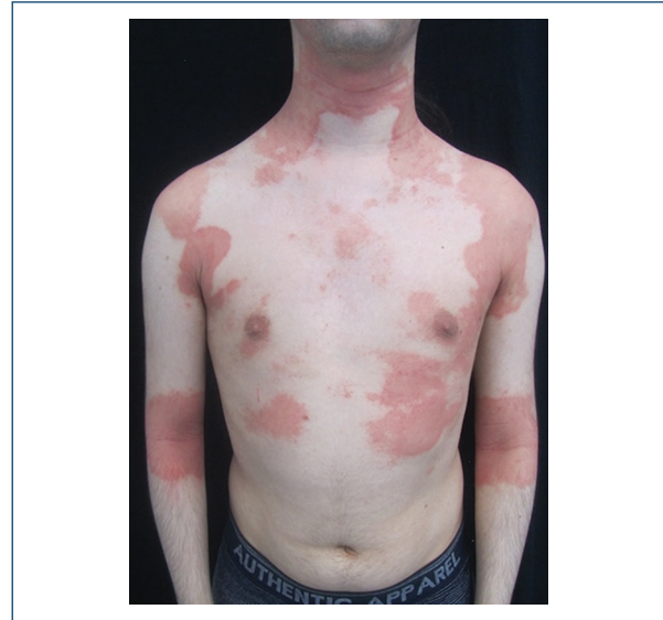
Figure 1. Monomorphic dermatosis localized to the neck, trunk, and upper limbs, characterized by well-demarcated erythematous patches and scaly surface.

A 32-year-old male with a 10-year history of AD and associated chronic prurigo reported intense pruritus and widespread eczematous lesions (EASI 17.3) (Fig. 3). He also described chronic mixed-pattern low back pain suggestive of axial spondyloarthritis. Previous