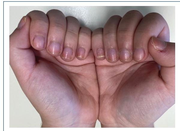
Figure 2. Substantial improvement in nail changes 3 months after treatment.

Topical therapy with betamethasone/calcipotriol foam was initiated, together with general protective nail care recommendations: keeping nails short, avoiding repetitive trauma, and minimizing prolonged exposure to water.